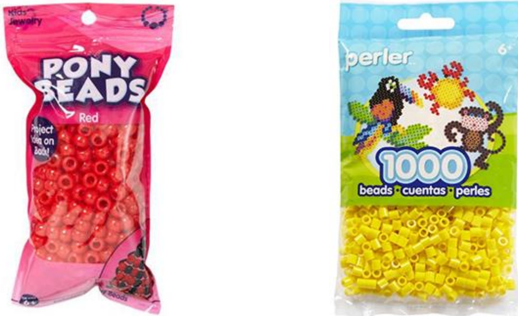
Pony beads and Perler beads in two different colors.

It is not necessary to find a new bottle to use. You can use one that you already have; one that came with something in it. Beverages, hand cream, shampoo, cooking oil, vinegar, and many other products come in colorless, transparent bottles. If you reuse a bottle, it must be cleaned thoroughly. If it contained an oily substance, be sure to wash it several times with soapy water to remove all the oil. Rinse whatever bottle you use with clear tap water several times. Partially fill the bottle with water, seal it, and shake it vigorously. When you stop shaking it, if the bubbles inside stay for longer than a second, rinse the bottle again, and continue to rinse it until the bubbles disappear immediately when you stop shaking the bottle.